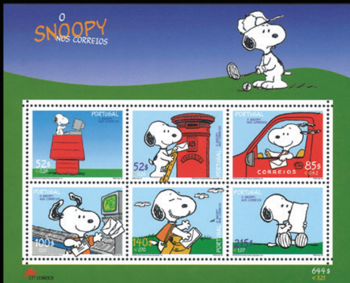
O Snoopy nos Correios Portugal, 2002